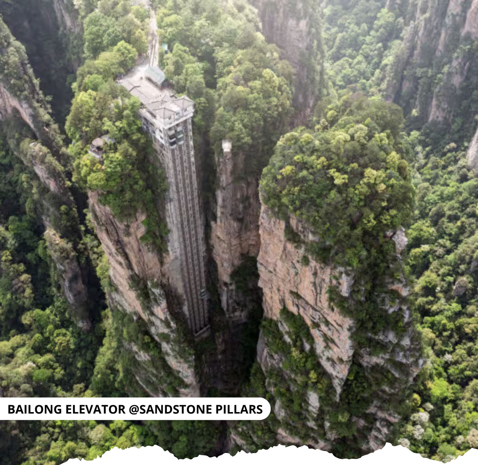
BAILONG ELEVATOR @SANDSTONE PILLARS